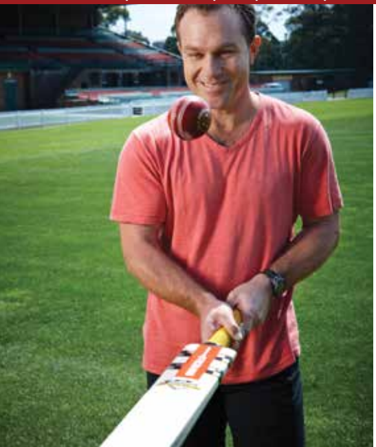
Healthy moves for your spine and joints